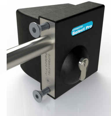
Key access on one side