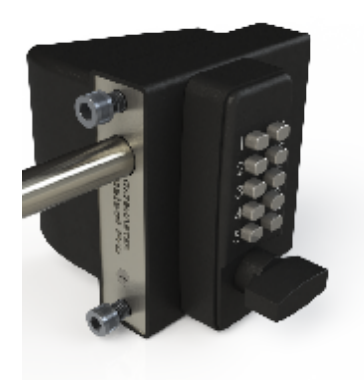
Digital keypad access on one side