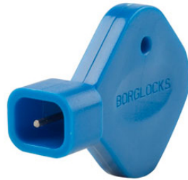
Code Change Key

The code should be changed with the door in the open position. To change the code you will need to know what the keypad is currently set to. The code can be changed with the unit fitted on/off the door.