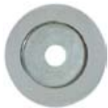
ML 6044 PSS - Dress Trim (use on soft wall fixture) Overall: 5mmD x 32mmØ Centre Section: 1.5mmD x 20mmØ