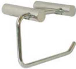
ML 6000 PSS - Single Toilet Roll Holder Overall: 145mmW x 90mmH x 85mmD Mounting: (C to C) 80mm Holder: 10mmØ Standoff: 60mm