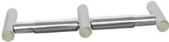
ML 6004 PSS - Double Toilet Roll Holder Overall: 300mmW x 20mmH x 85mmD Mounting: (C to C) 140mm Standoff: 60mm Rollers: Chrome Plated ABS