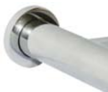
ML 6044 PSS - Dress Trim (in situ)