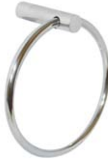
ML 6040 PSS - Towel Ring Ring: 165mmØ Overall 10mmØ Material Overall: 180mmH x 85mmD Standoff: 60mm