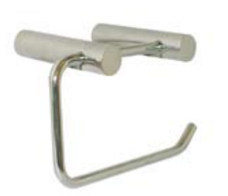
ML 6000 PSS - Single Toilet Roll Holder Overall: 145mmW x 90mmH x 85mmD Mounting: (C to C) 80mm Holder: 10mmØ Standoff: 60mm